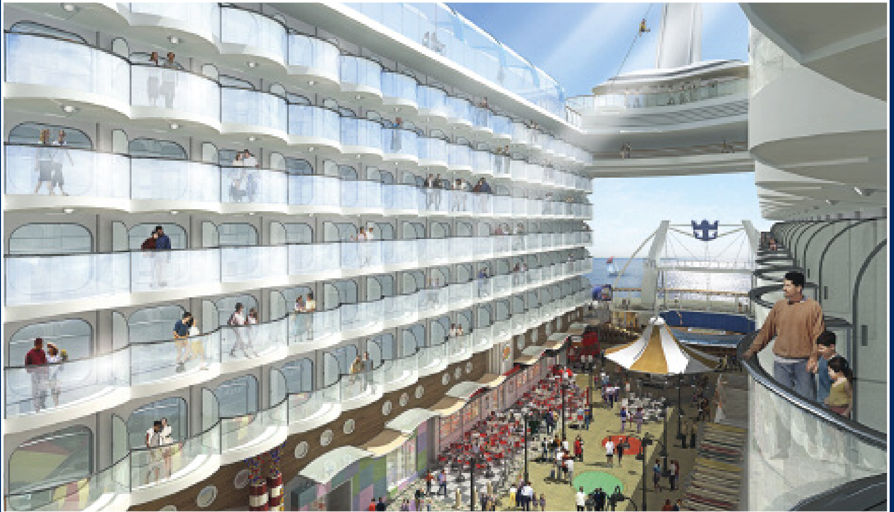
Boardwalk View balcony staterooms