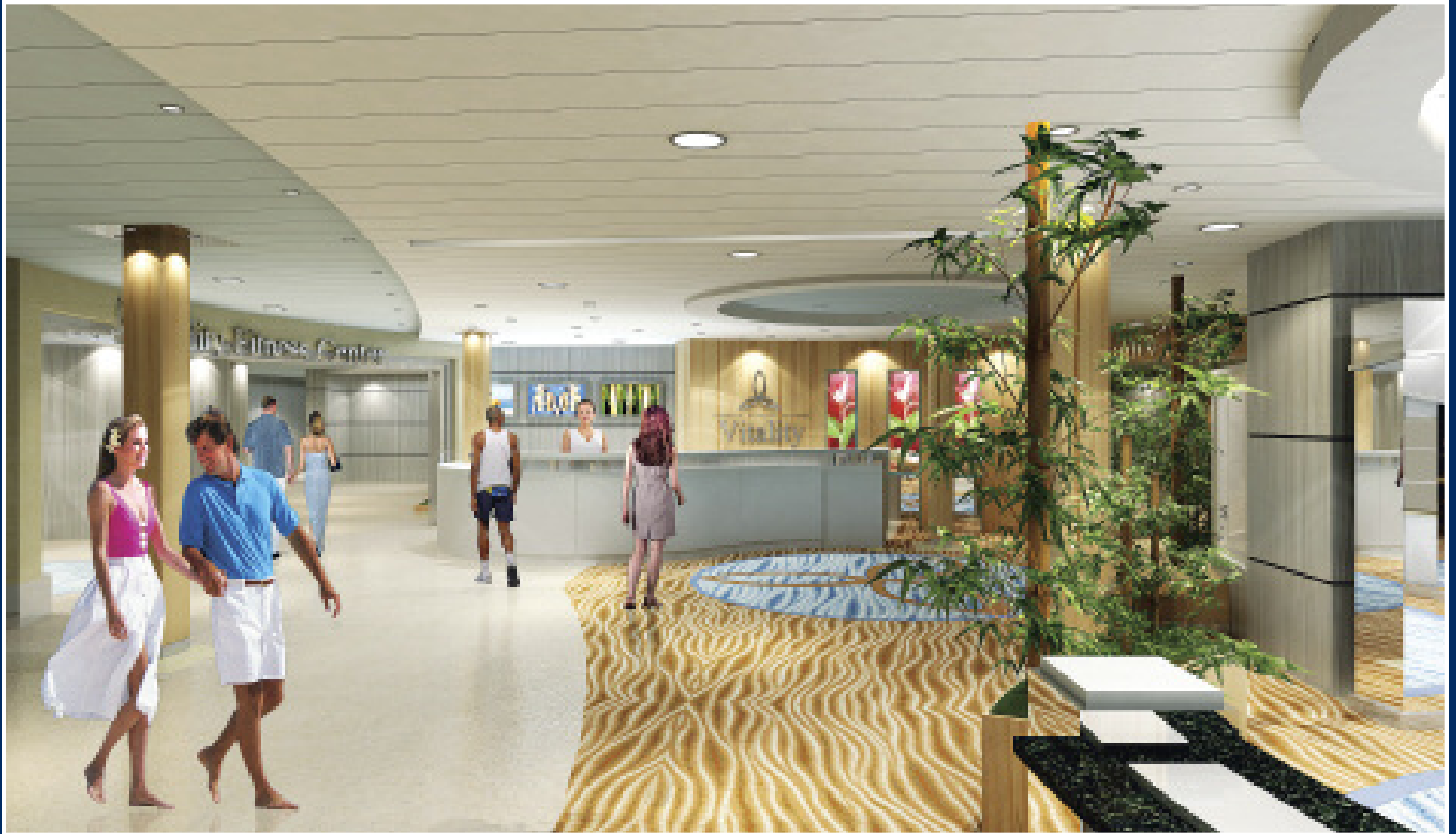
Entrance to Vitality at Sea Spa & Fitness