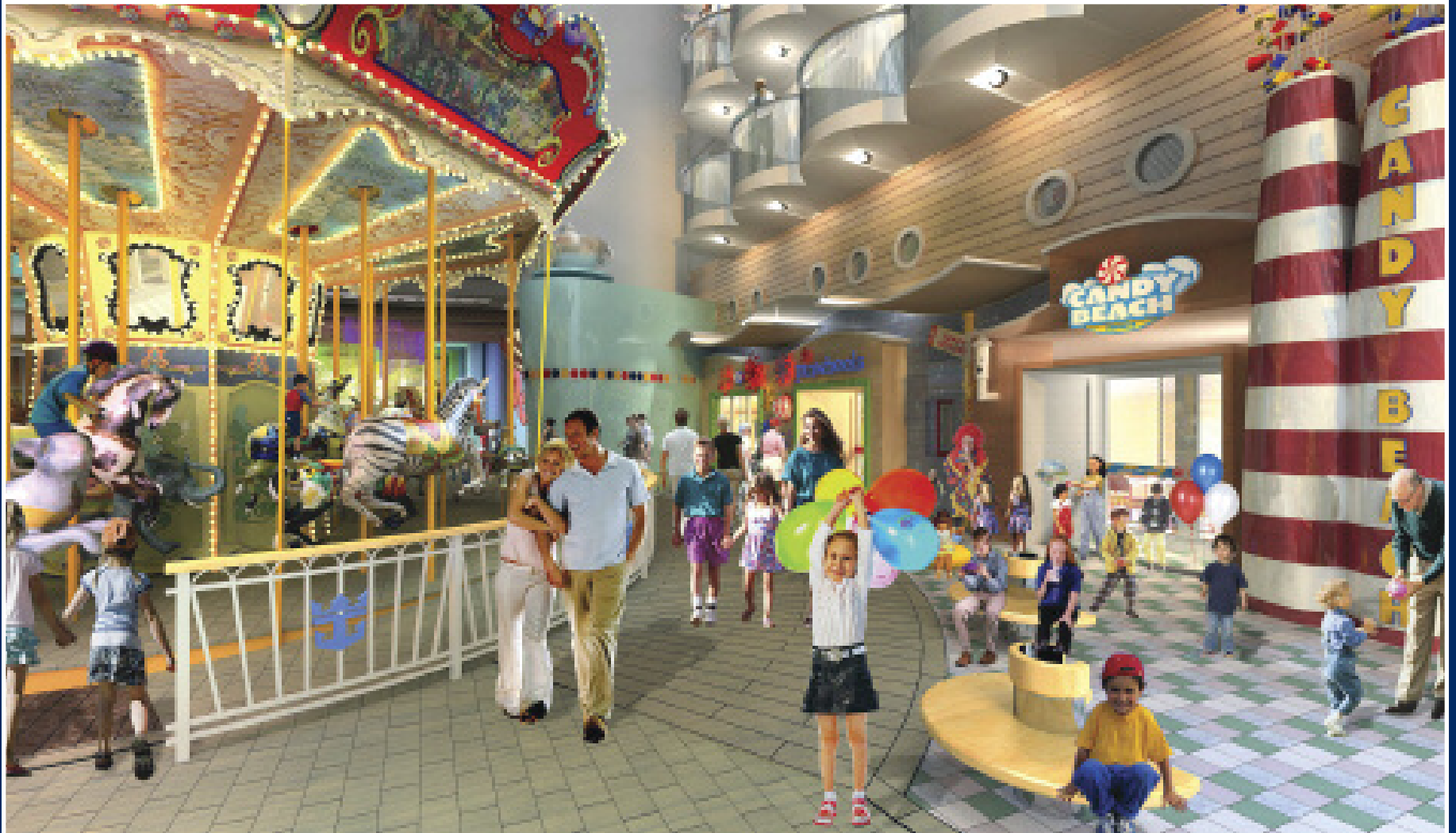
The Carousel and Candy Beach