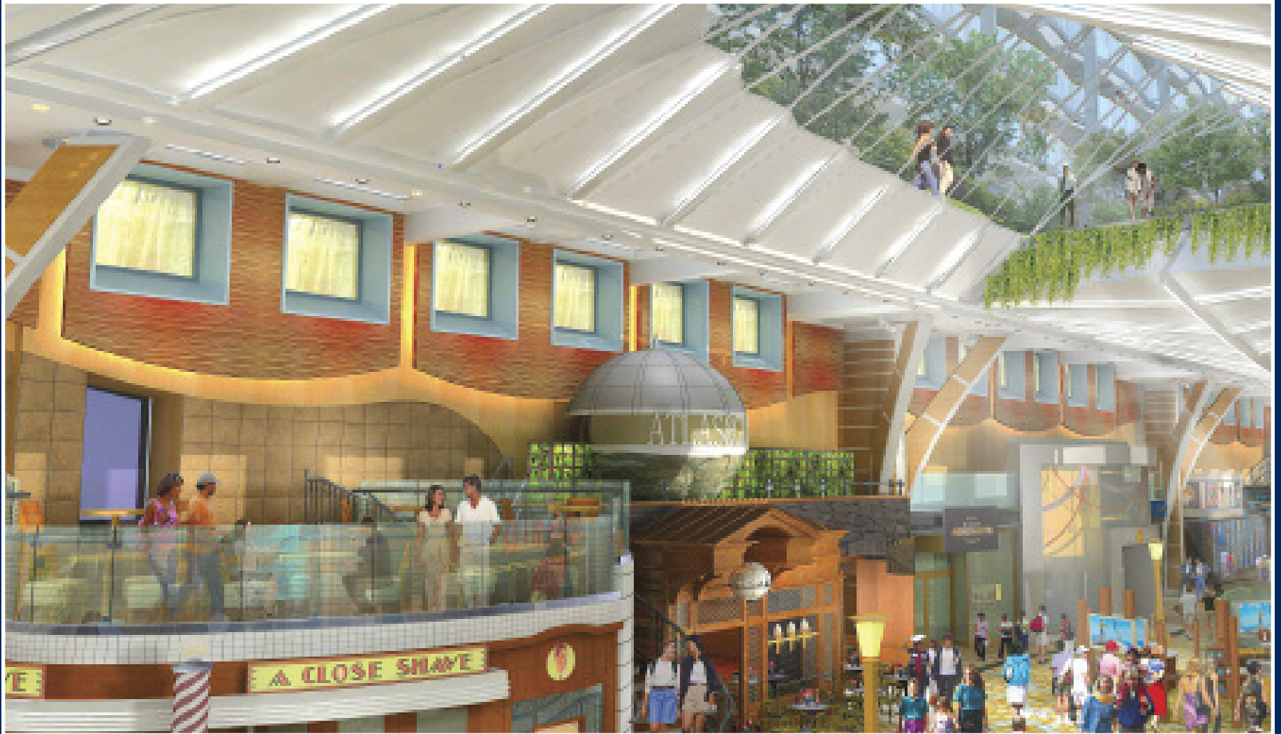
Promenade View staterooms