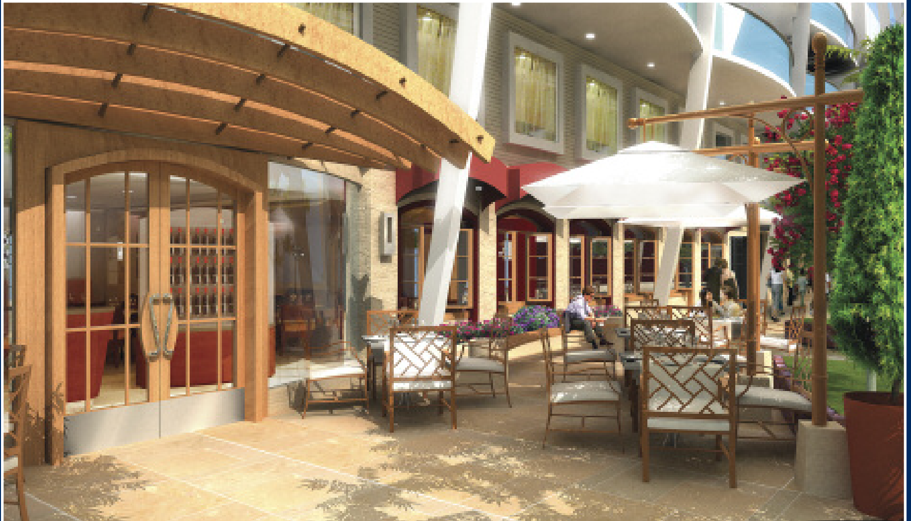
Antonio's Table Italian trattoria