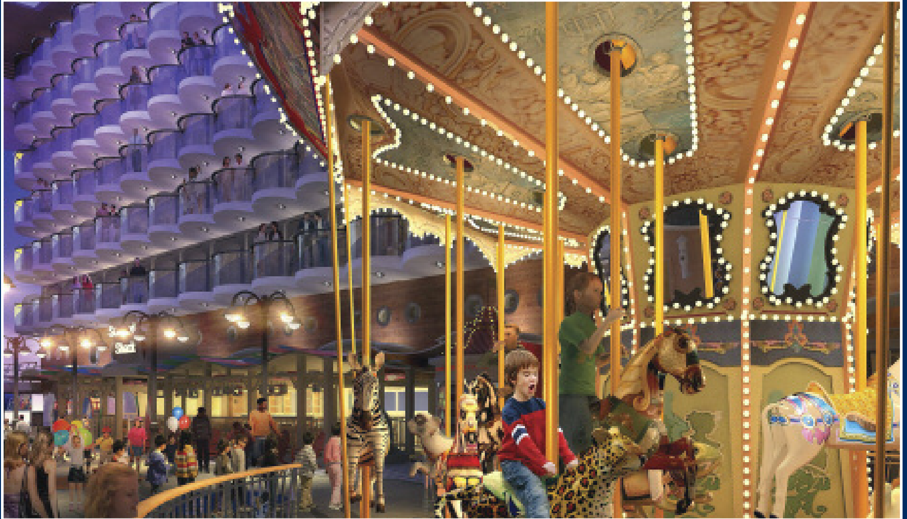
Boardwalk View Balcony Staterooms overlooking the Carousel and Boardwalk