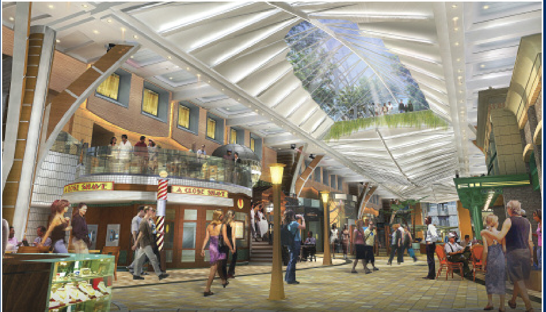
Royal Promenade featuring a Crystal Canopy skylight