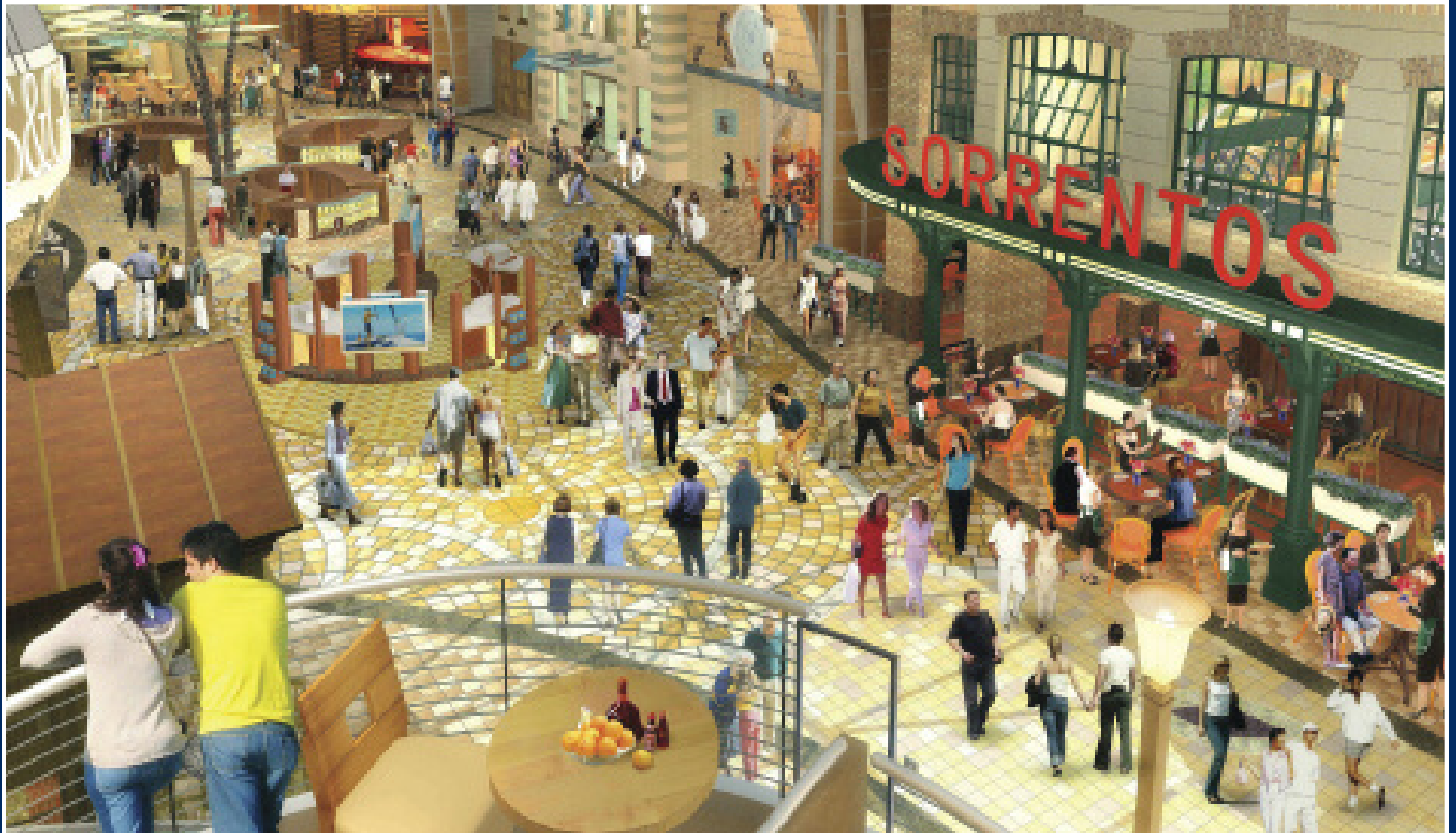
View of the Royal Promenade from the mezzanine