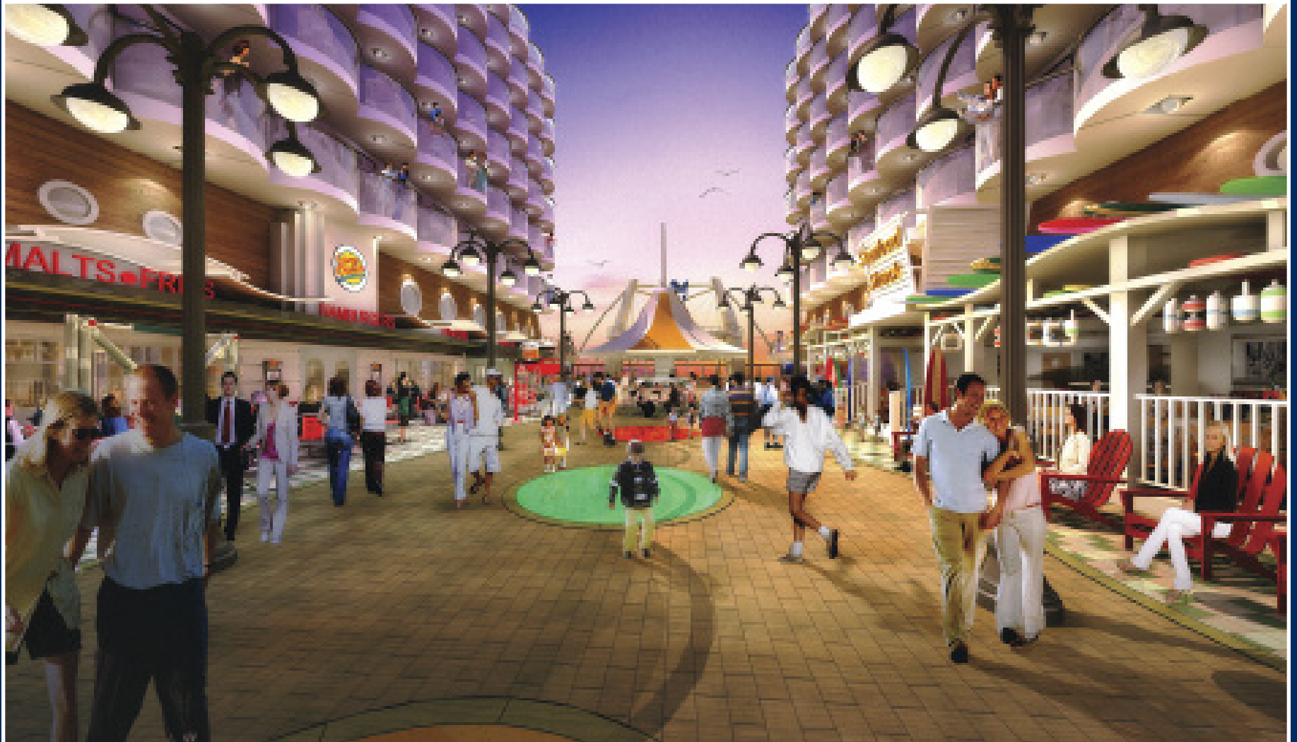
Boardwalk looking aft