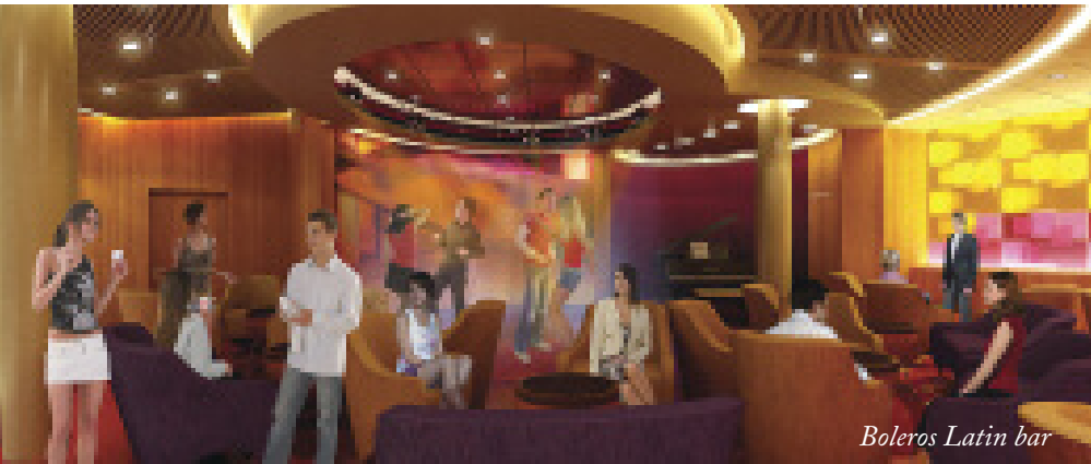
Boleros Latin bar