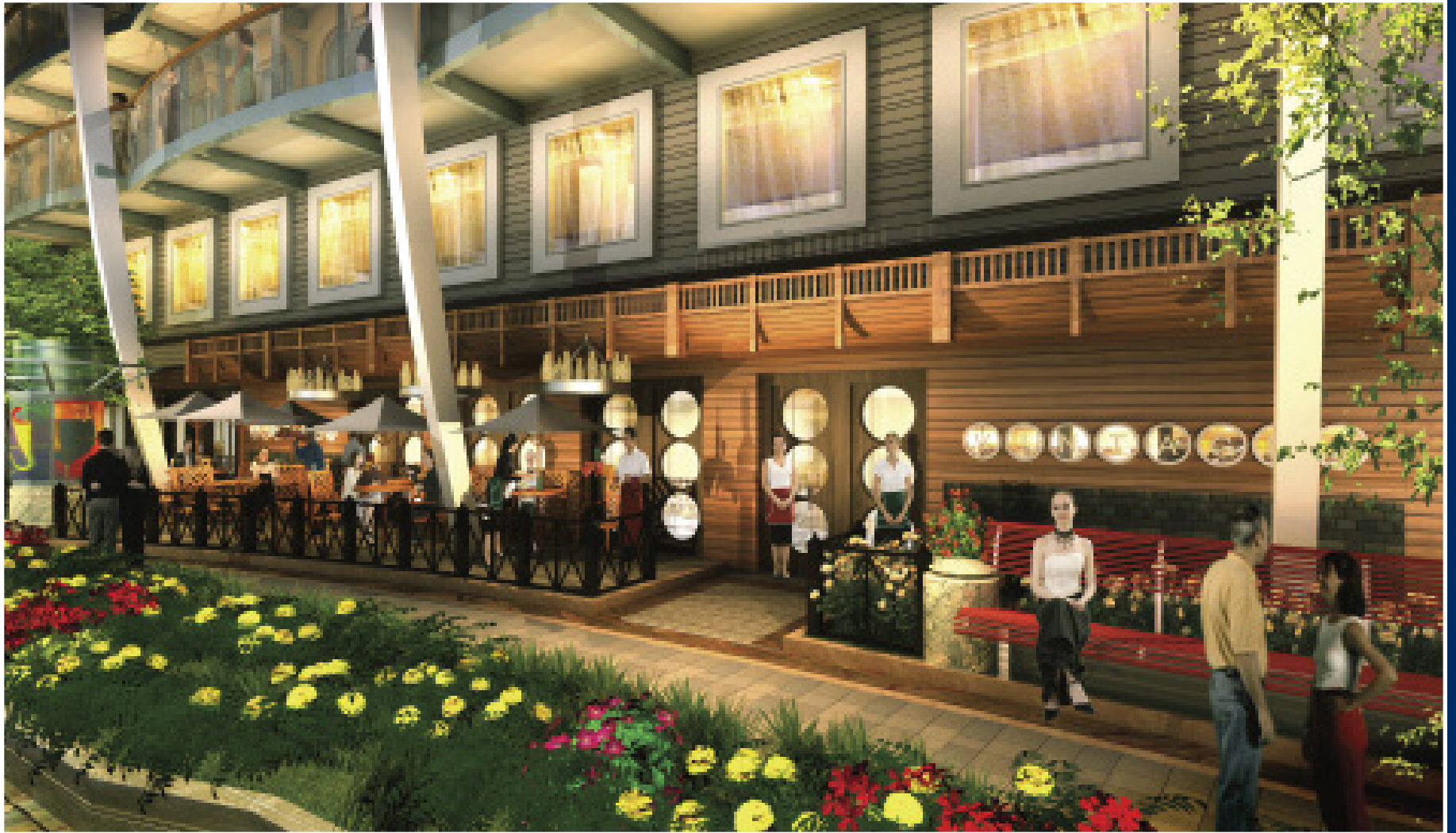
Vintages wine bar