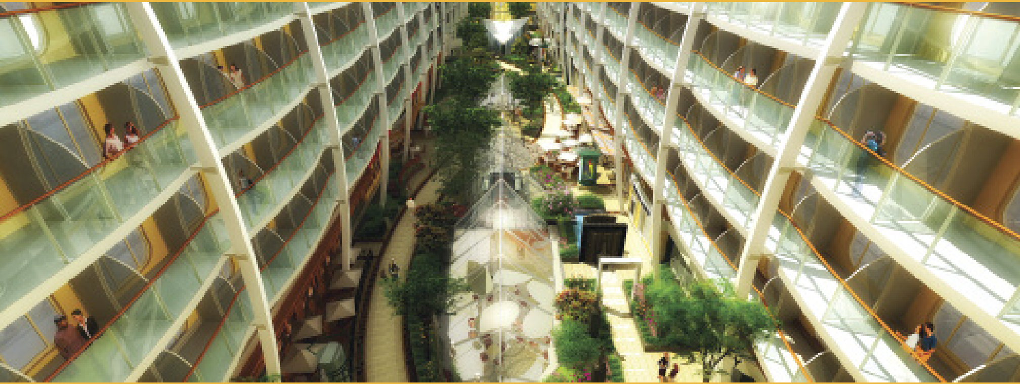
Central Park View balcony staterooms