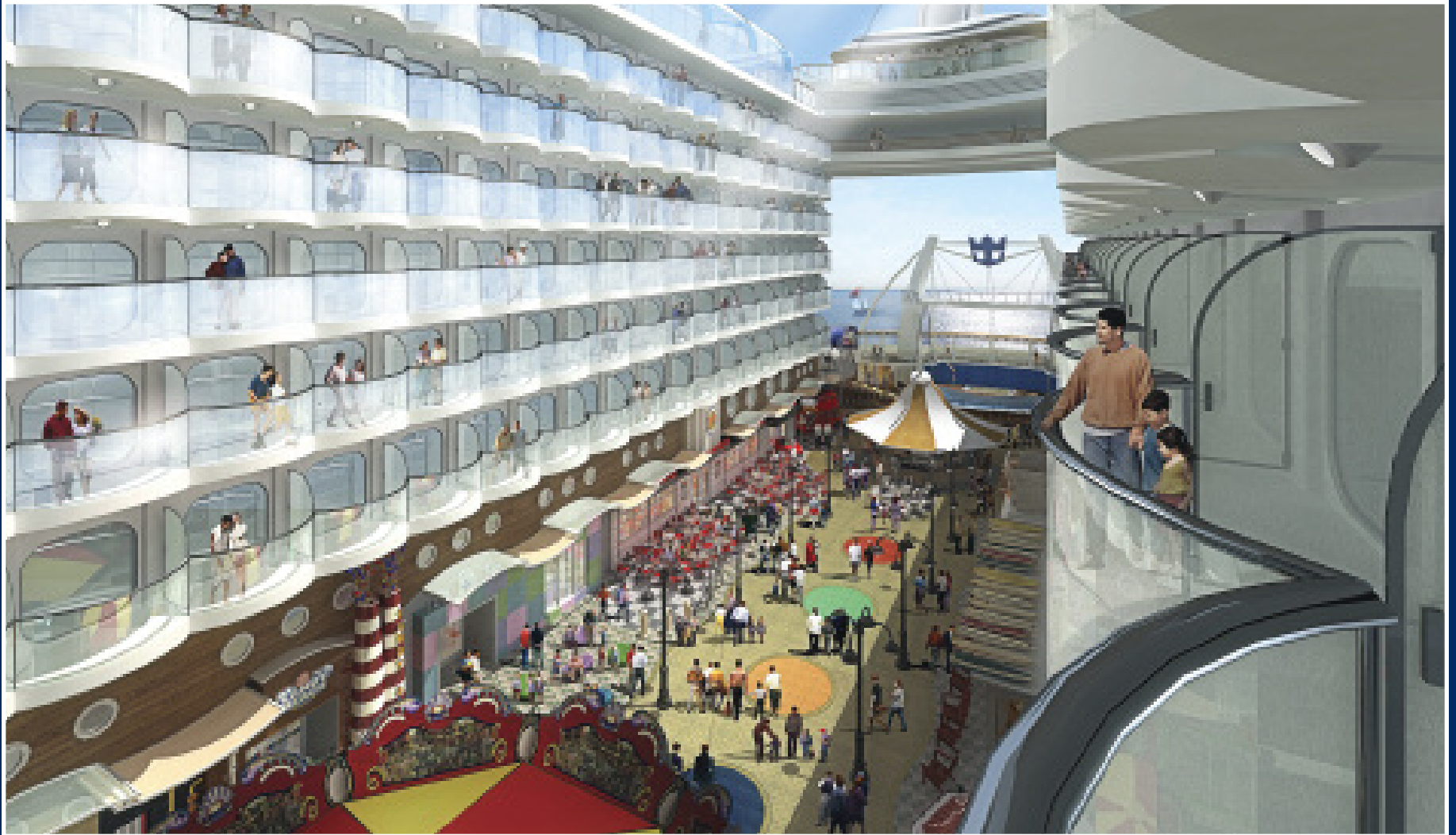
Boardwalk View balconies