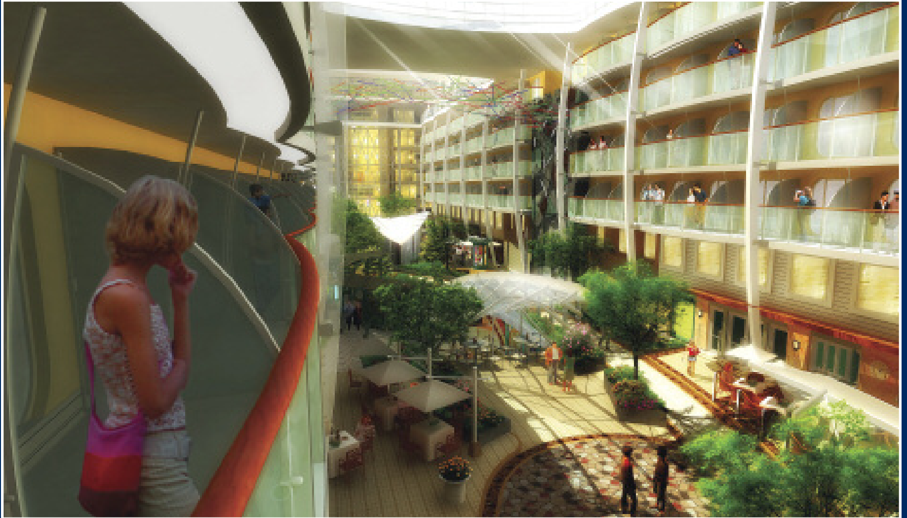
Park View balcony staterooms overlooking Central Park