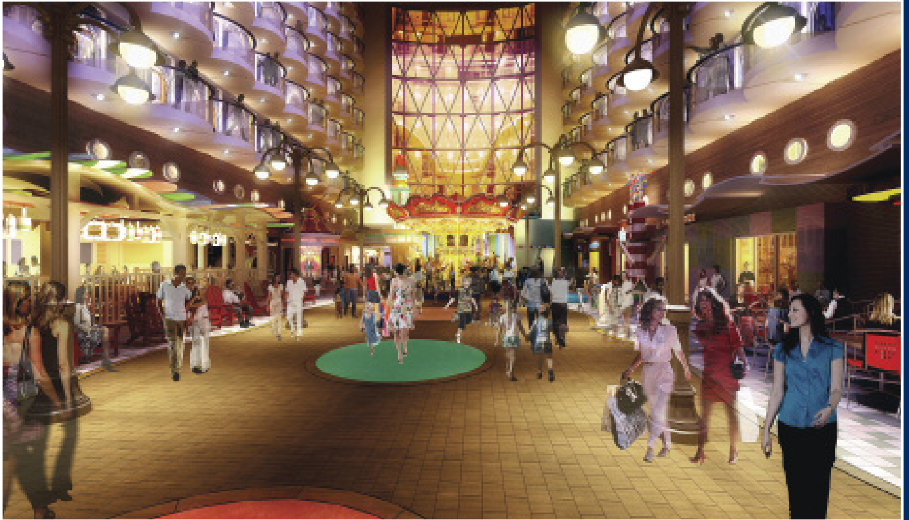
Boardwalk looking forward