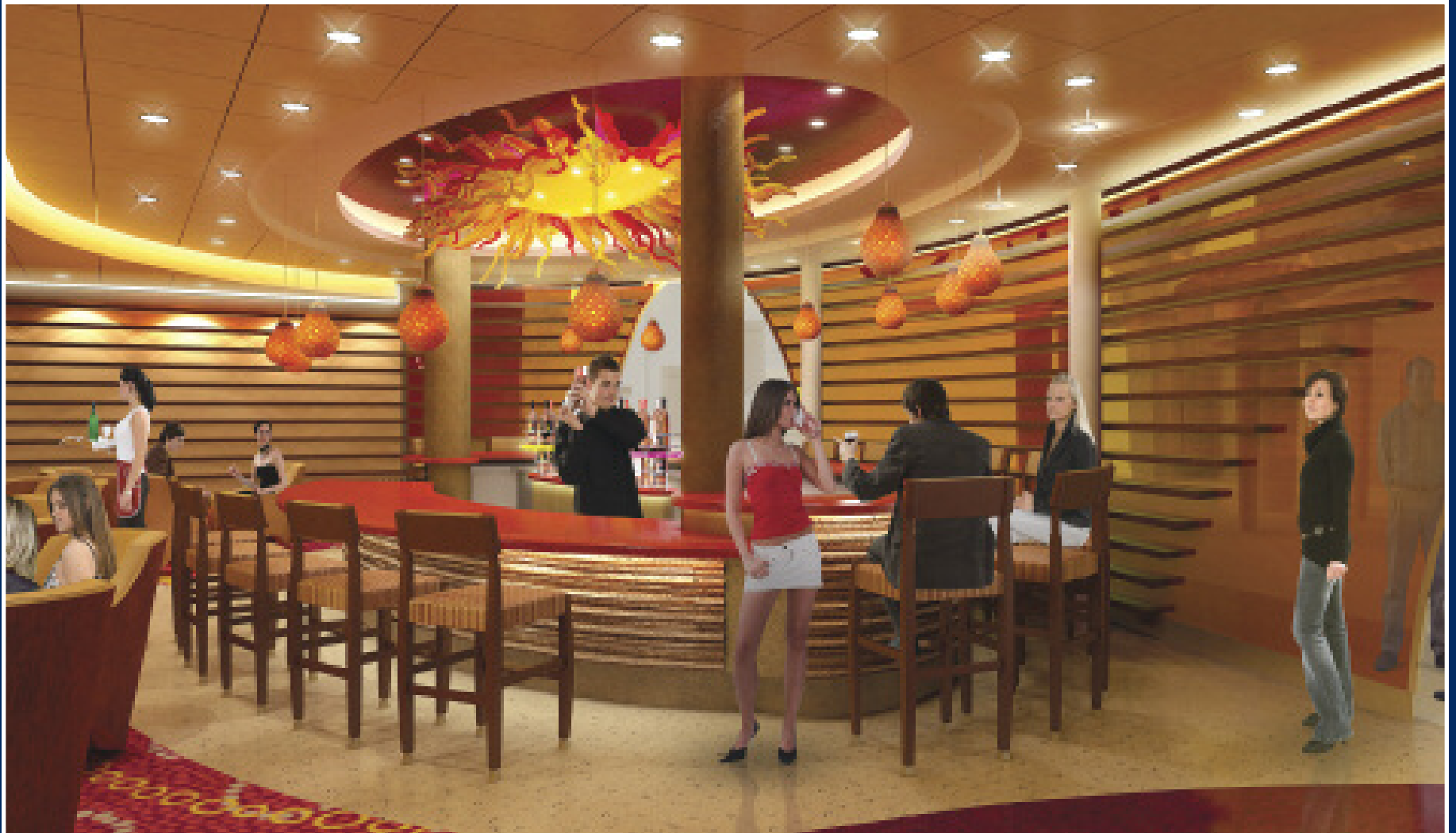
Boleros Latin bar