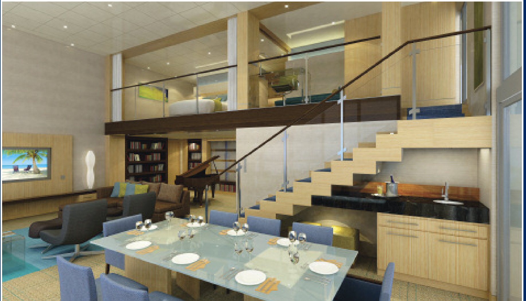
Royal Loft suite