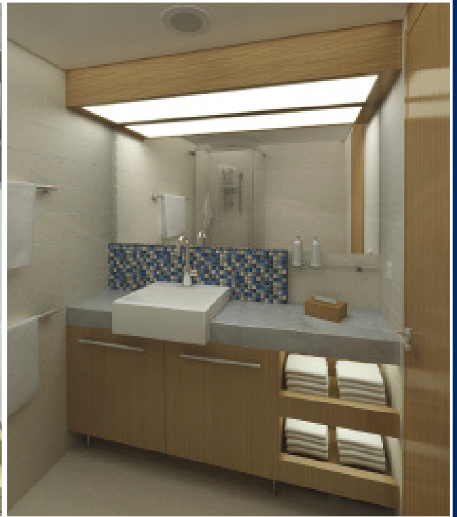
Crown Loft suite balcony, and bathroom